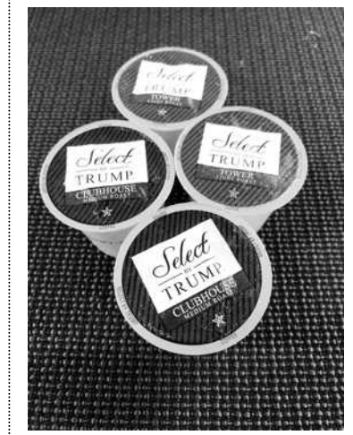
This week's 2nd prize: The best coffee that was ever made ever.

▶ THE STYLE CONVERSATIONAL The Empress's weekly online column discusses each new contest and set of results. Especially if you plan to enter, check it out at wapo.st/styleconv.